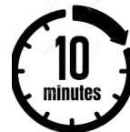
Add sample to