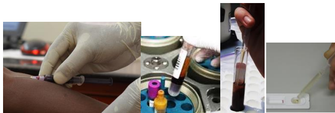
Blood Collection test device